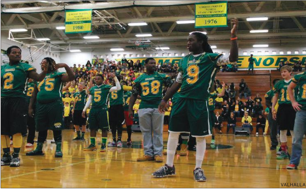
The homecoming pep assembly will be in the gym after second hour on Friday, Sept. 30. Performances will include the North Pep Band, dance team and choir, along with the battle of the classes in the pep assembly games. Students should show off their spirit by wearing their class shirts.